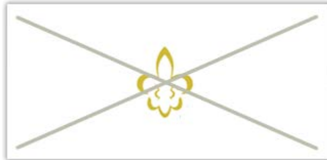
improper use of the LA CaTS Center logo continued

DO NOT manipulate or extract elements of the logo. The LA CaTS Center logo should be used in its entirety.